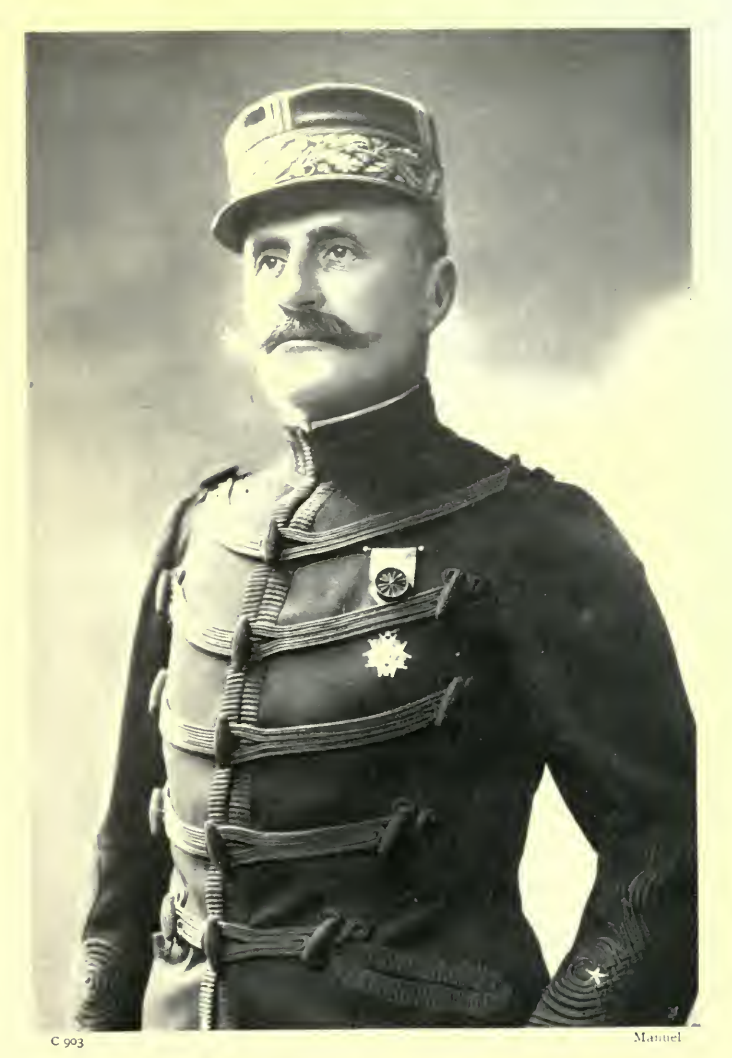
GENERAL FOCH Chief of the French General Staff.